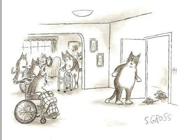
"Who gets meals on wheels?"