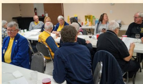
Pictures from our Merrittion Lions joint meeting held at the Island Moose Lodge on October 23rd. Great fellowship, good food and lots of fun was had by all.