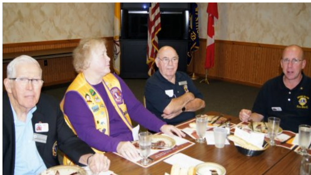
Joint Meeting of Grand Island and Merritton Lions Clubs held at the Grand Island Knights of Columbus Hall on October 9th 2013.