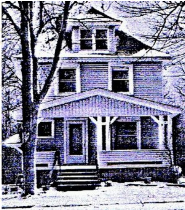
Picture of the family Justice Center

The Brandel-Murphy Youth Foundation has also provided past matching grants to us for the Miracle League playground, the annual Special Kids Picnic held at the Buffalo Launch Club, and the new playground at Sidway Elementary. All told, $13,000 obtained from the generous donations of local citizens to our club and matching grants from the Foundation have made life better for all kids who live and visit here. Once safe to do so (hopefully in June), work will commence to complete the rehabilitation of the center. At that time, the $3,000 funding will be released to the center.