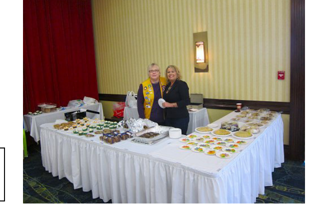
Grand Island Lions Spaghetti Dinner. Held on April 28th at Byblos Resort and Spa.