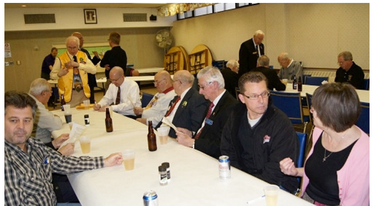
Pictures from our April 10th joint meeting with the Merritton Lions Club. A good time was had by all.