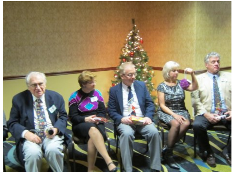
Lions examine their "gifts."