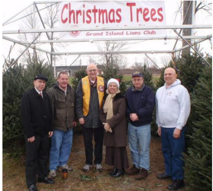
Lion workers at the Tree Stand in front of Kelly's Country Store

No meeting December 22nd due to the Christmas Holiday