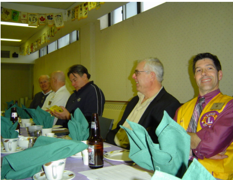
Grand Island and Merritton Lions enjoying the joint meeting in Merritton ON. on March 12th.